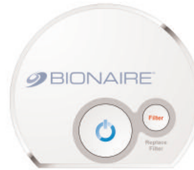
100 Series Without Filter Indicator Lights