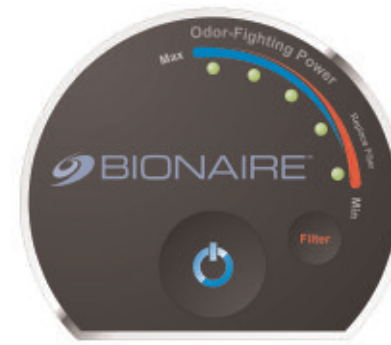
100 Series With Filter Indicator Lights